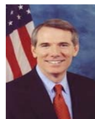
ROB PORTMAN (R) PORTMAN.SENATE.GOV