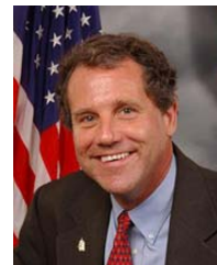
SHERROD BROWN (D) BROWN.SENATE.GOV